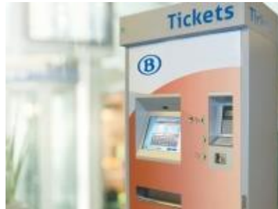
Tickets may be purchased from the Belgian Railways machine.

The airport train to Gare du Midi costs about €8 and takes about 20 minutes. It is accessible from the basement level of the airport.