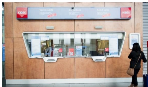
Reloadable travel cards are only available for purchase at certain metro stations (such as at Gare du Midi), from manned kiosks.

If you come to Brussels often, you may consider purchasing a reloadable card (costs €5) which allows you to buy ten trips for €14 from any of the STIB/MIVB GO machines. This card, however, is not available for purchase at the GO machines; you would need to buy it from the manned kiosk inside the Gare du Midi metro station.