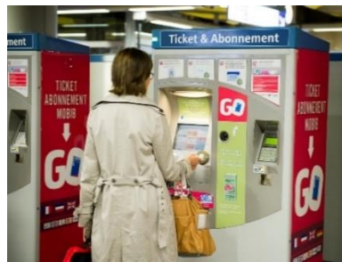
You may purchase individual tickets or reload your travel card at the GO machine (however, reloadable travel cards may not be purchased here).

Tickets for tram 81 may be purchased from the driver for €2.50 (please have correct amount), or you may purchase your ticket from the STIB/MIVB GO machine (there is a GO machine outside the Gare du Midi station, in the area of the tram).