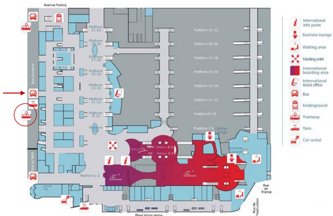
The stop for tram 81 is located outside the Gare du Midi, highlighted by the arrow in the image above.

The International Associations Centre can be accessed from Gare du Midi train station. From Gare du Midi/Zuid Station, take the tram 81 in the direction of Montgomery and stop at Bailli. From there, it is a short walk to the International Associations Centre.