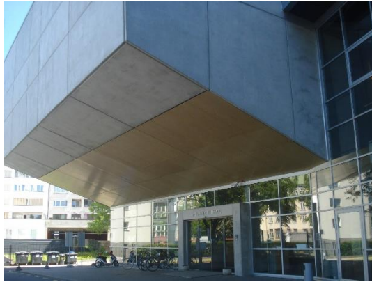
Tallinn University Mare Building entrance (Event venue)