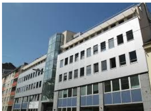
Entrance to the venue

The event map is available here: https://drive.google.com/open?id=1C0ihx1GWfu3S-1Z6zFotLB3ackVurVyU&usp=sharing