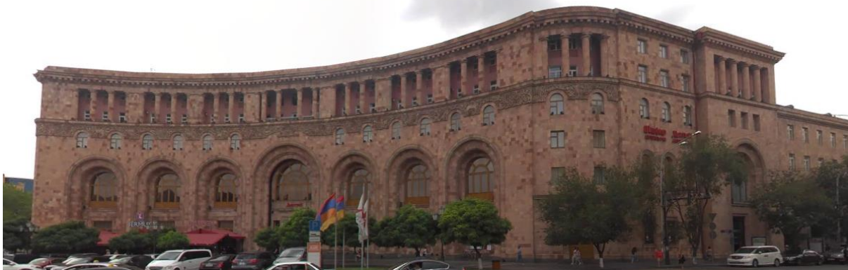
Armenia Marriott Hotel (Event venue)

https://drive.google.com/open?id=1LxkpMCpGrcYqU4kkbnaAibNFNPHb5HPI&usp=sharing