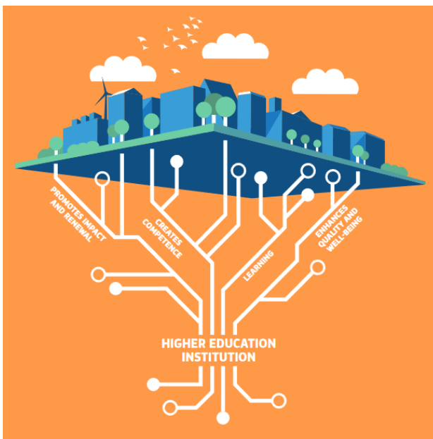
FINEEC's audit model 2018-2024

FINEEC audits are carried out in Finnish, Swedish and English. FINEEC may also carry out audits outside Finland as paid services. HEIs that pass the audit receive a Quality Label, which is valid for six years.