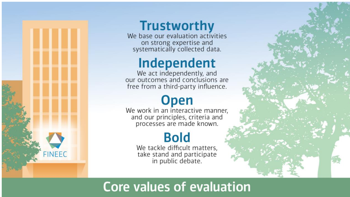
Figure 2 The core values of evaluation as stated in FINEEC’s strategy for 2020-2023.

The key operating principles of FINEEC are the independence of evaluation and enhancement-led evaluation. Other core values as emphasised in FINEEC’s new strategy for 2020-2023 (see Figure 2) are trustworthiness, openness and boldness.