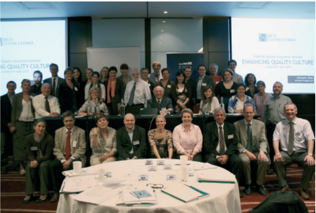
Seminar on Internal Quality Assurance - Enhancing Quality Culture, London, 2010