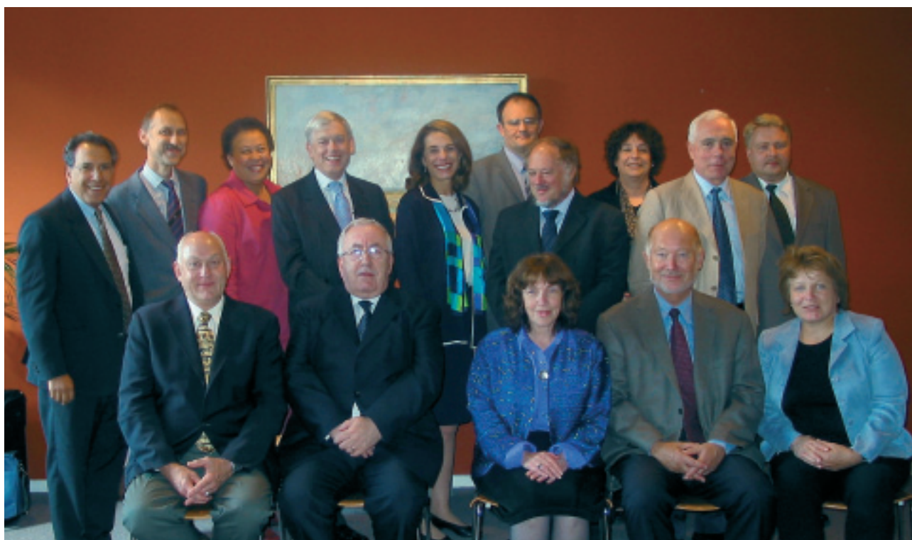
ENQA meeting with U.S. Regional Accreditation Commissions, Copenhagen, 2005