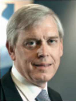
PETER WILLIAMS, President of ENQA from September 2005 to September 2008