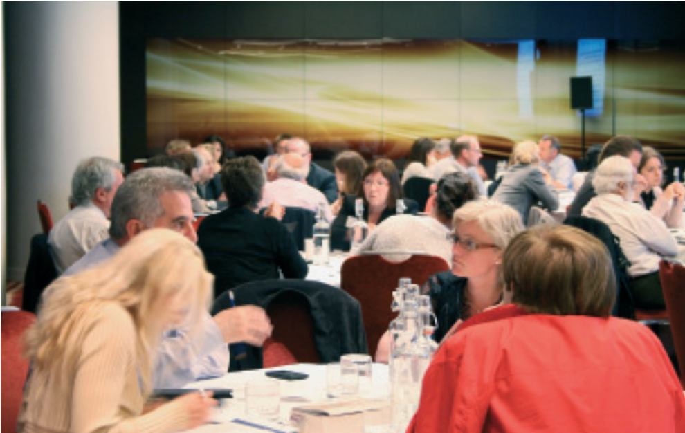
Seminar on Internal Quality Assurance - Enhancing Quality Culture, London, 2010