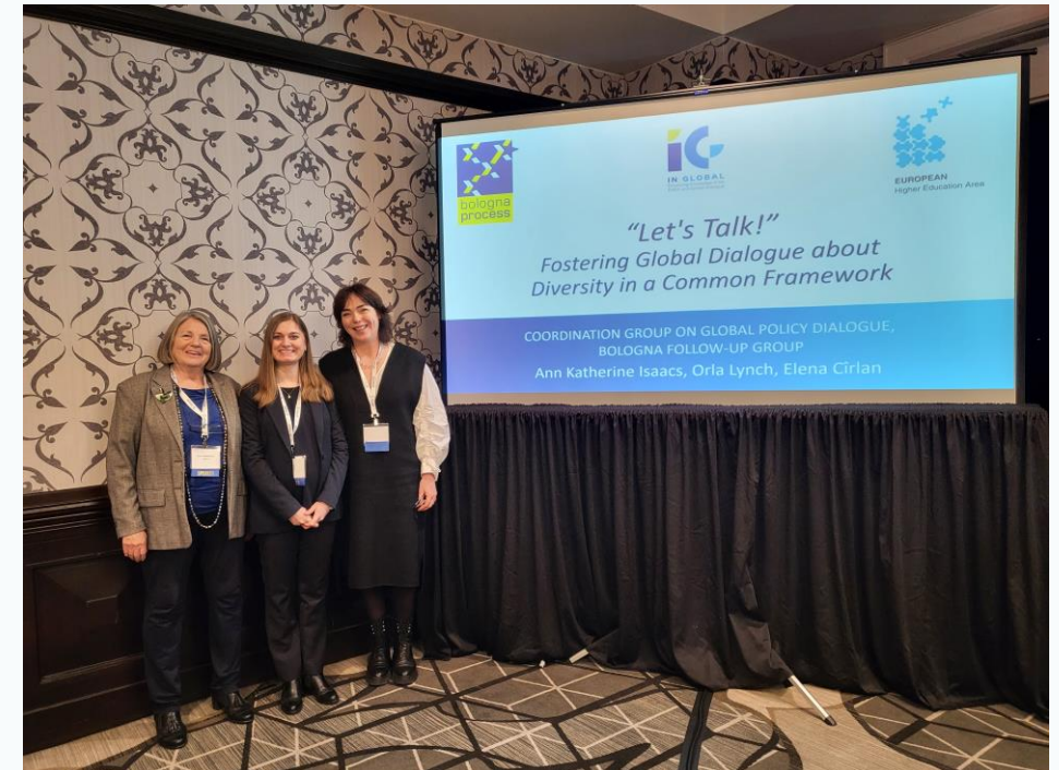
Let's Talk: Fostering Global Dialogue About Diversity in a Common Framework – CHEA Conference, January 2023